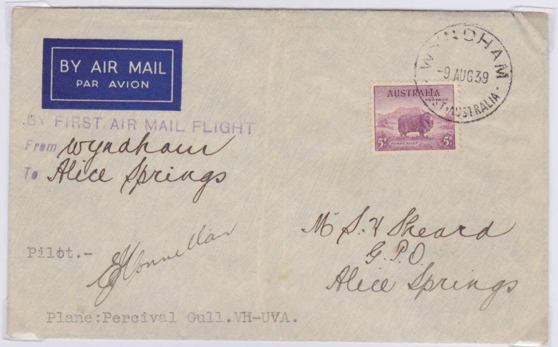
Wyndham 9 August 1939, Alice Springs 11 August

Connellan Airways commenced operations with a flight from Alice Springs to Wyndham via Mount Doreen, Tanami and Victoria River Downs. 64 lbs of mail including 70 souvenir covers was carried on this flight but how many return covers were carried is not known. Connellan Airways eventually serviced 120 stations, towns and mining camps.