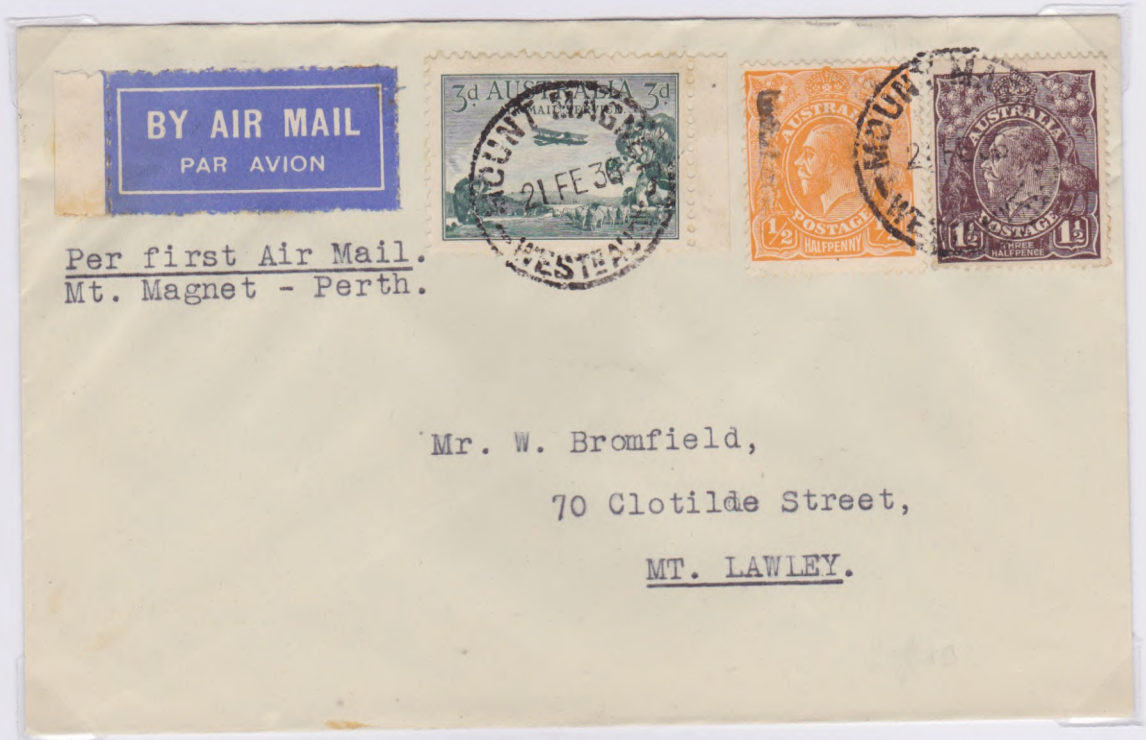
Mount Magnet 21 February 1936

60 covers were carried in the first official mail on the Mt Magnet- Perth leg.