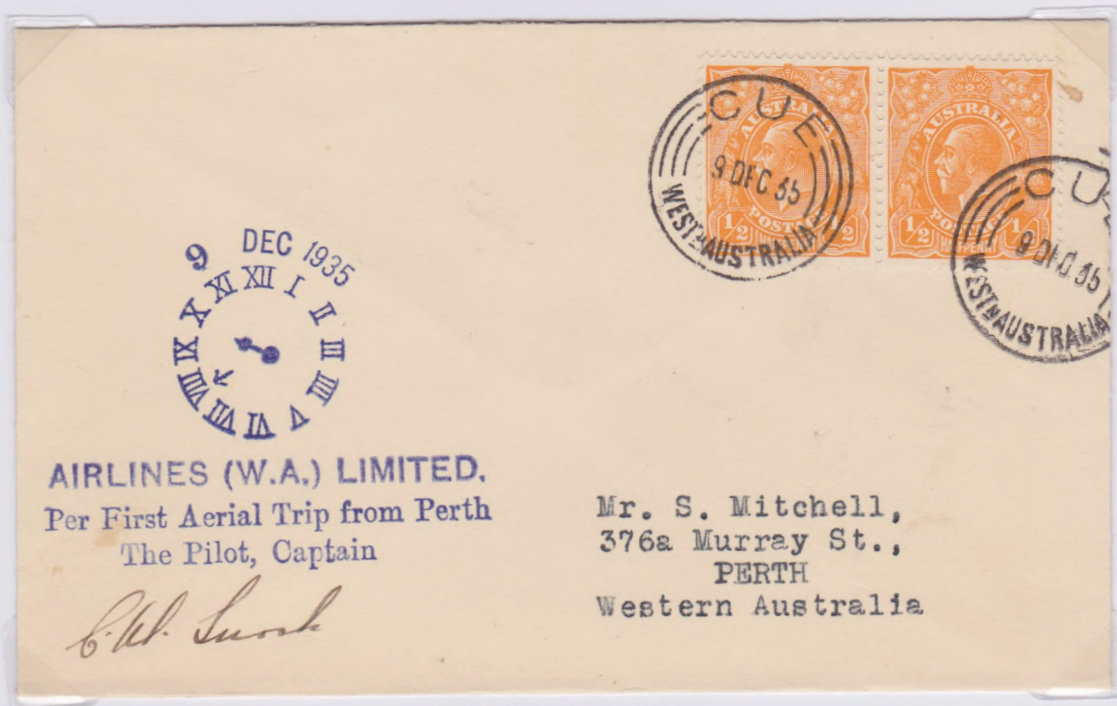
Cue 9 December 1935

Having lost the Perth-Daly Waters contract and had the subsidy withdrawn from the Perth-Adelaide route, WA Airlines sought to expand its operations by opening a service to Cue, Mt Magnet, Meekatharra, Wiluna, Leonora and Kalgoorlie. The first flight carried unofficial souvenir mail.