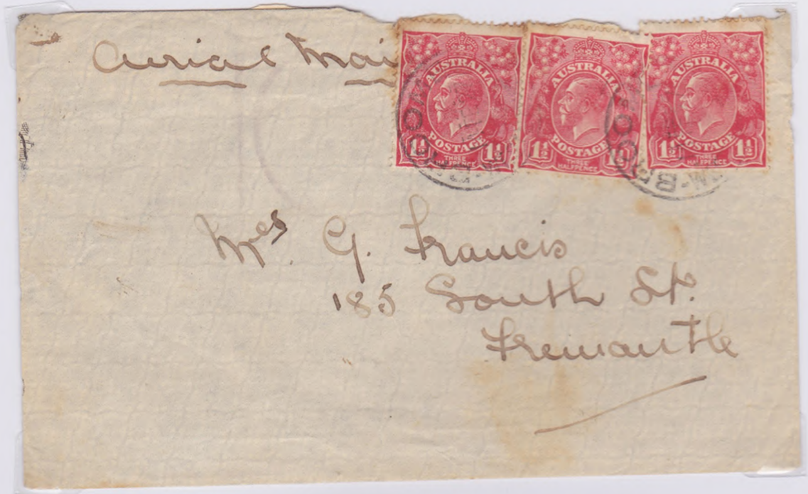
Broome 14 February 1927, faint Forwarded by Airmail cachet

Airmail rate was constant until 1959 at 3d per half ounce with funds to be used for defence purposes.