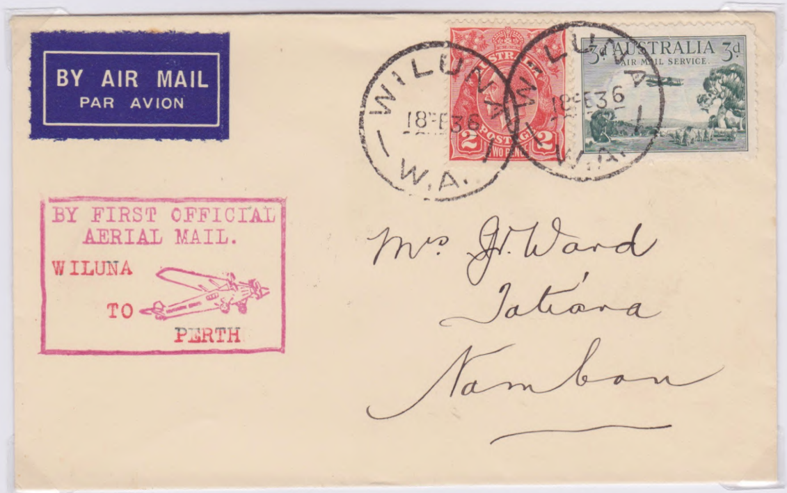
Wiluna 18 February 1936, Perth 18 February, by rail to Namban