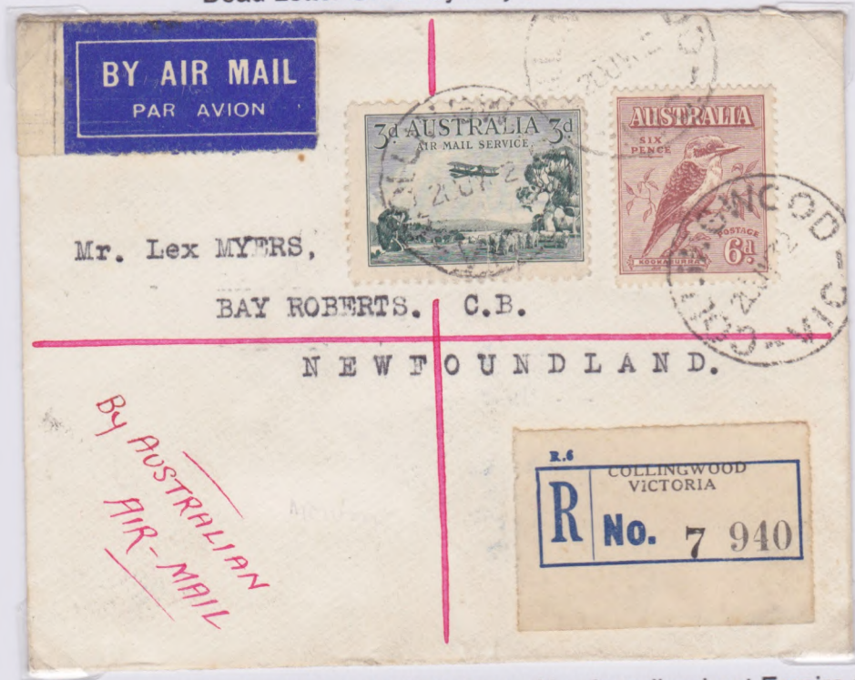
2d postage, 3d airmail, 3d registration, 1d (late fee or Newfoundland not Empire rate) = 9d Collingwood 20 July 1932, Melbourne 20 July, Perth 25 July, Montreal 31 August