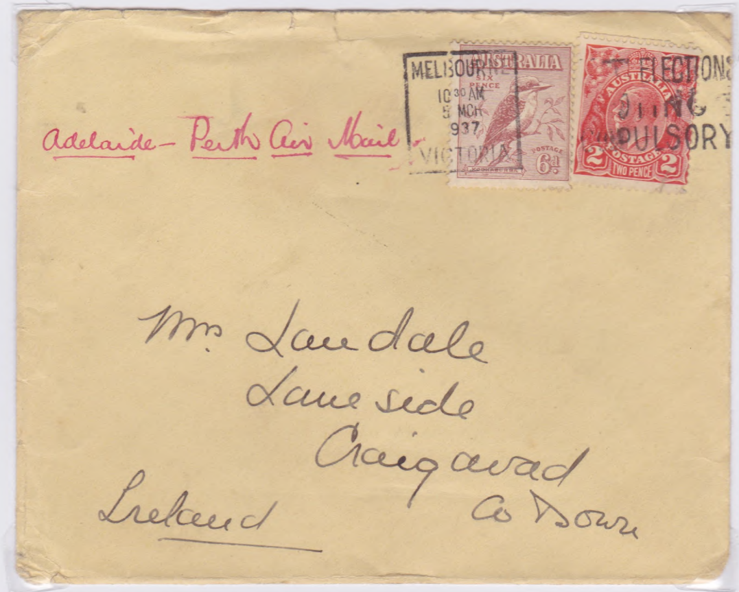
2d postage, airmail one ounce 6d = 8d Melbourne 8 March 1937