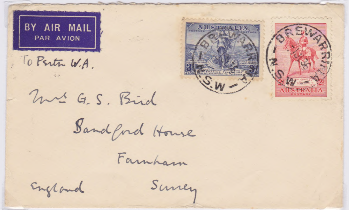
Brewarrina 1 June 1936

Some chose the 3d airmail via Fremantle as a cheaper option to the 6d via Karachi or 1/4d via Sydney.