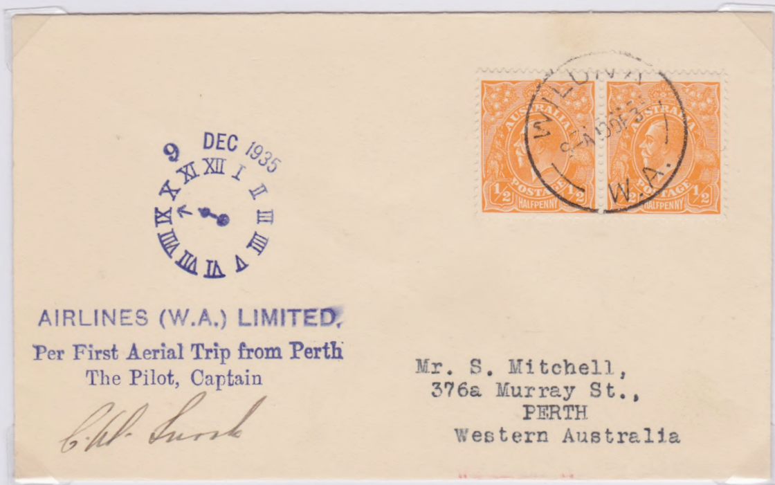
Wiluna 10 December 1935