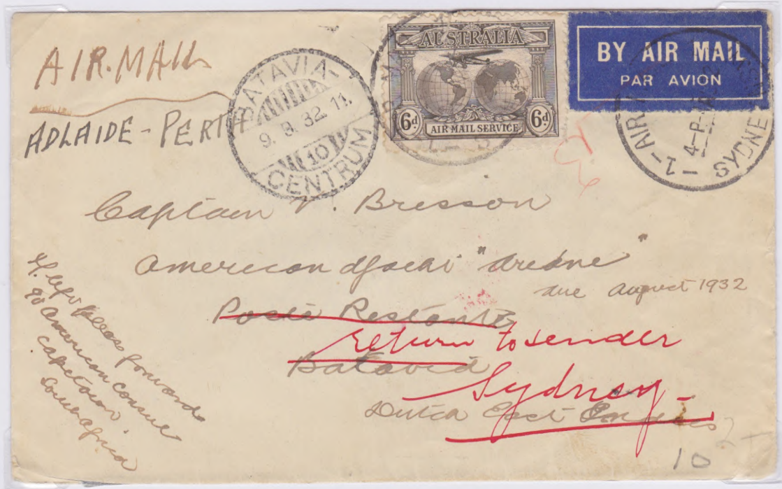
Sydney 12 February 1932, Batavia 9 March, Vertrokken label, Dead Letter Office Sydney 5 October