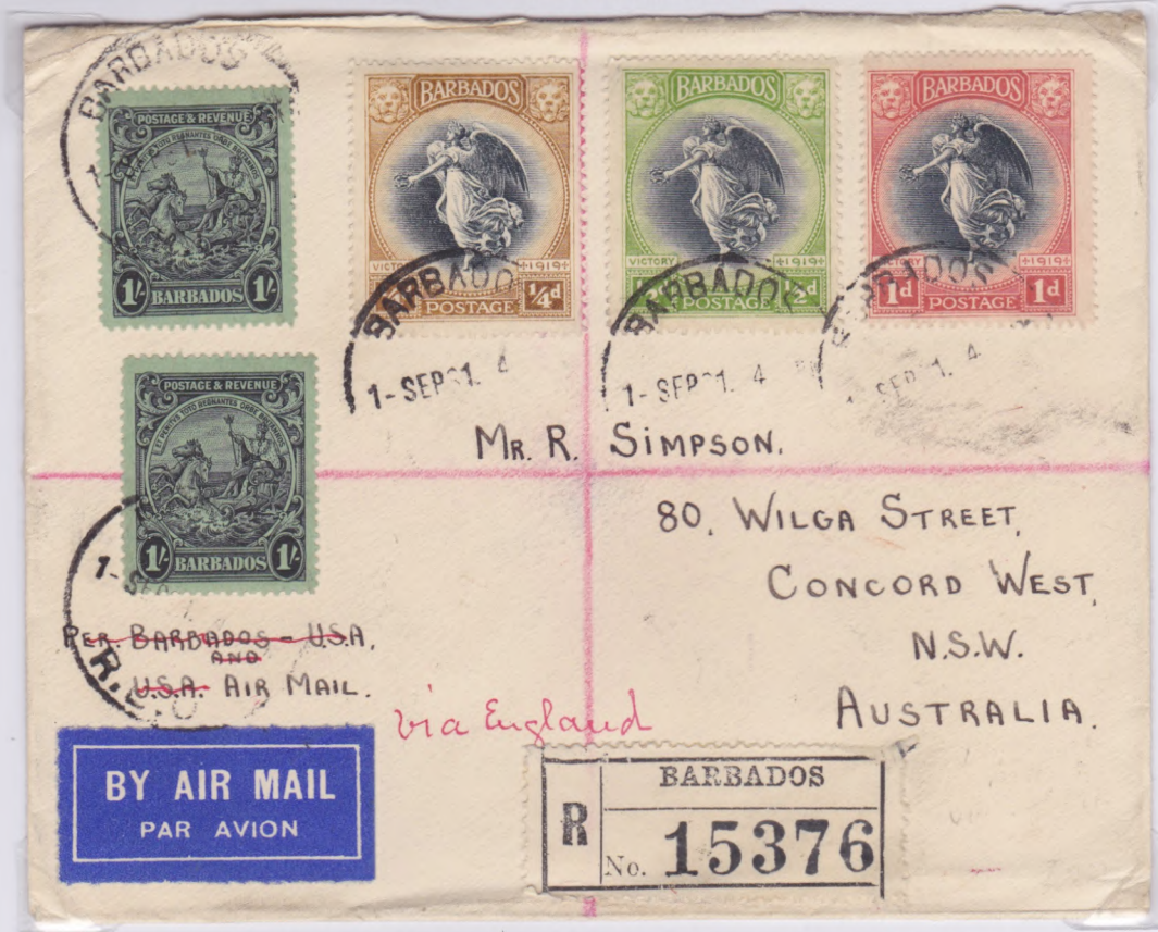
Barbados 1 September 1937, Perth 12 October, Adelaide 14 October, Melbourne 14 October