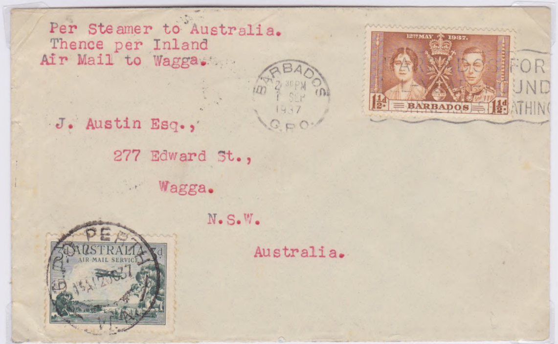
This cover seems to have been prepaid for airmail in Australia by affixing the 3d airmail stamp. Barbados 1 September 1937, Perth 12 October, Adelaide 4.30am 14 October, Melbourne 11.45am 14 October